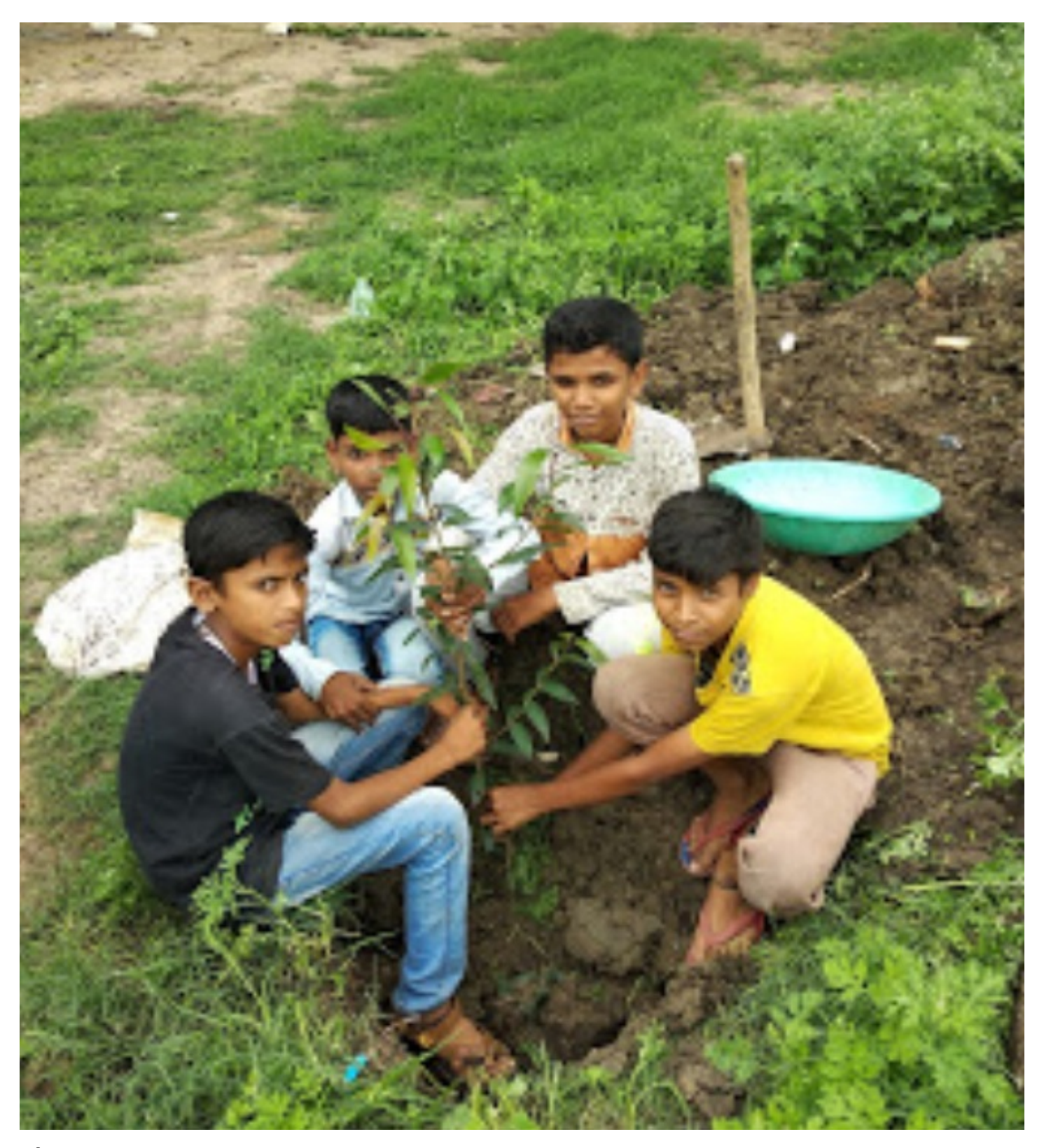
\textbf{A} \textbf{round 200+ saplings were planted in association with farmers \& school kids of bategare village in sedam taluk, Gulbarga district