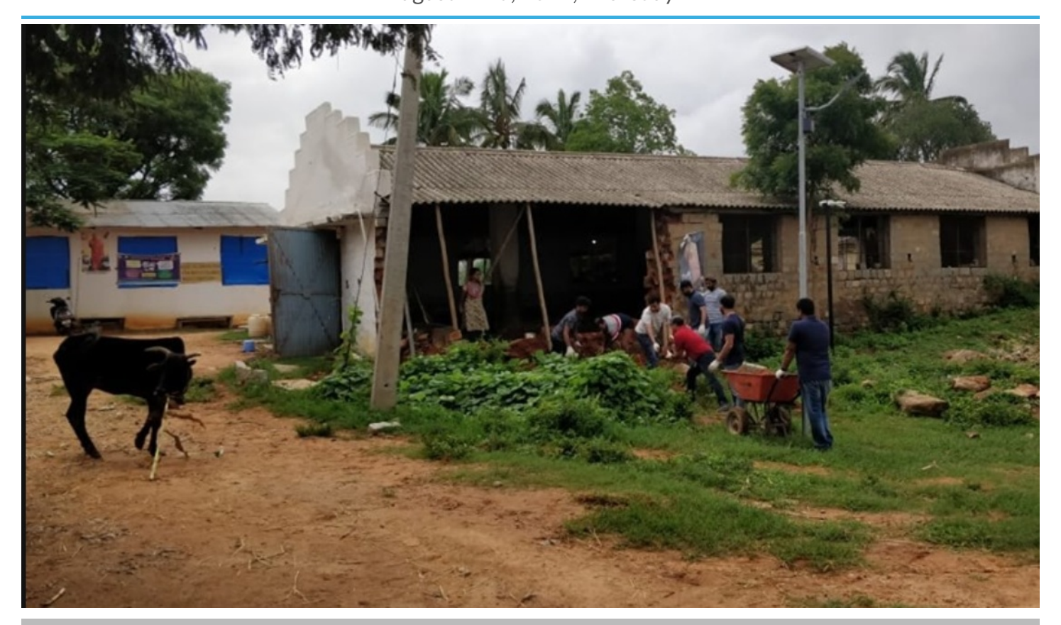
"Goumaya Ganesha" Workshop, Giridhari Goushala, Karachakanahalli, HBR layout August 24<sup>th</sup> 2019, Saturday

GoPals Dell-EMC volunteers Involved in cleaning of broken wall due to heavy rain at Sri Raghavendra Gou Ashrama, Malur August 22nd, 2019, Thursday