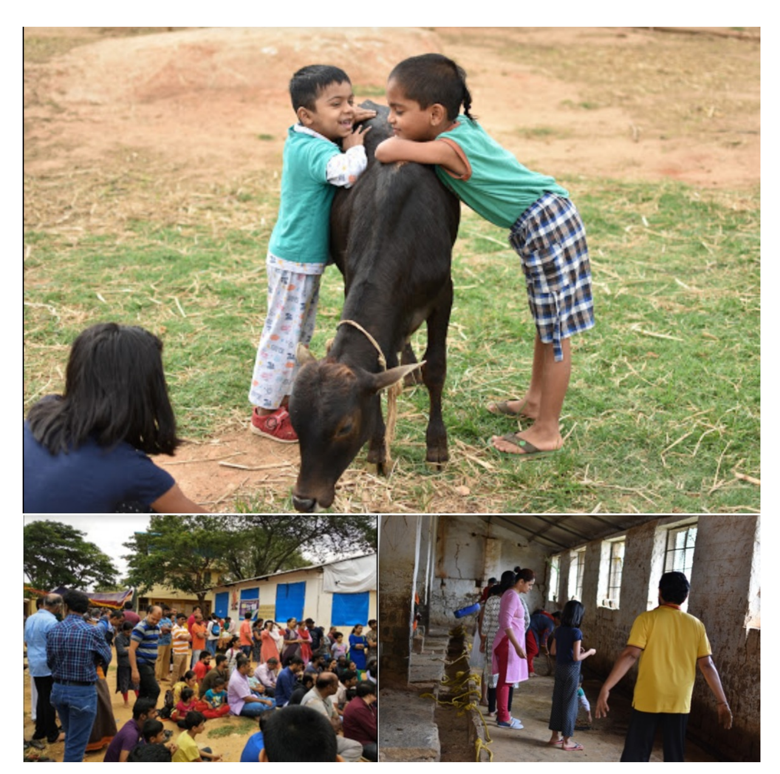
Team of around 250+ native cow lovers participated in the event. It was encouraging to see children and adults enthusiastically participating in all of the event activities.