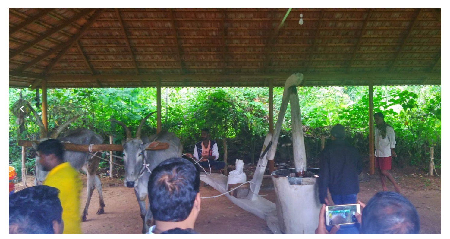
Interactive and informative session