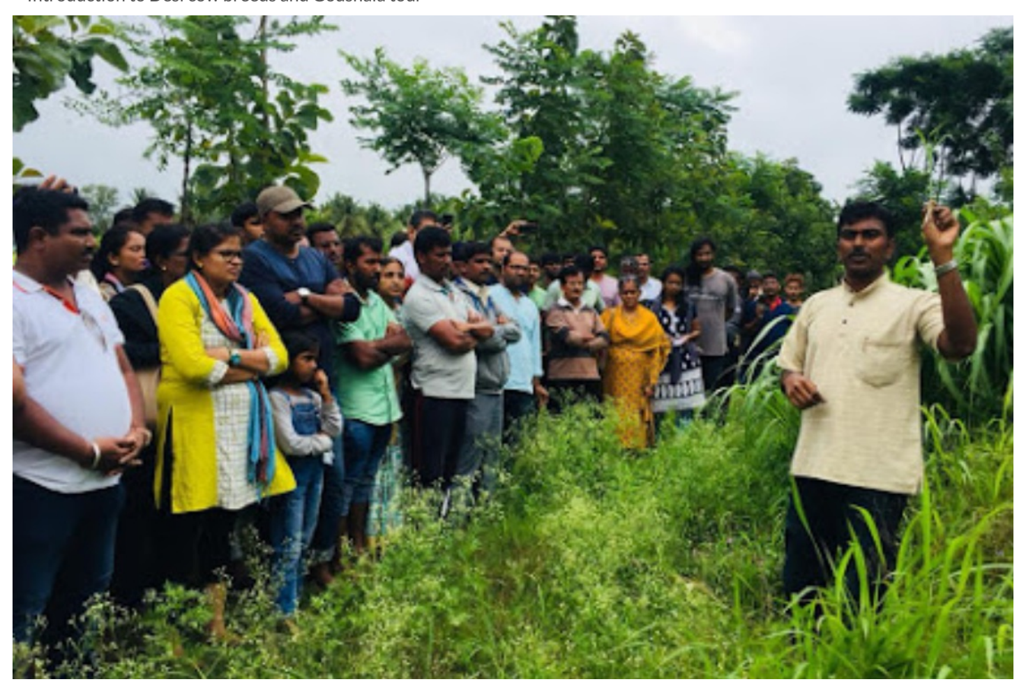
Visit to one acre 100 crops model