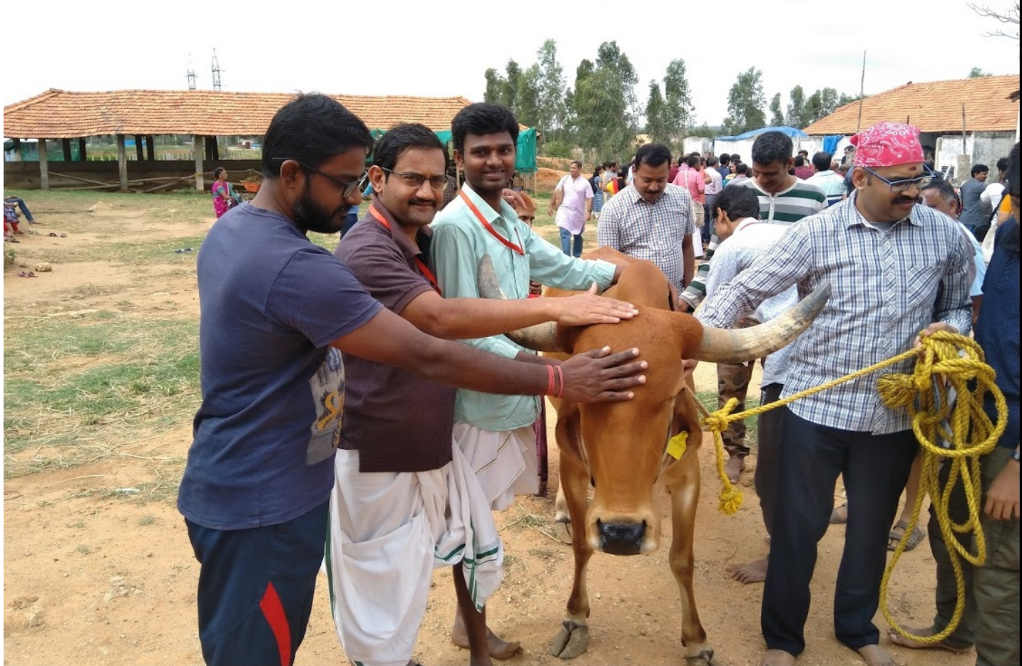
The event attracted attention from print and social media as well,