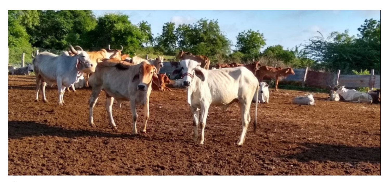
A ll volunteers were provided delicious breakfast and lunch. To read full report, click the link below,

Detailed Report- I Love ,I Care ,I Serve -Native Cows , Hyderabad