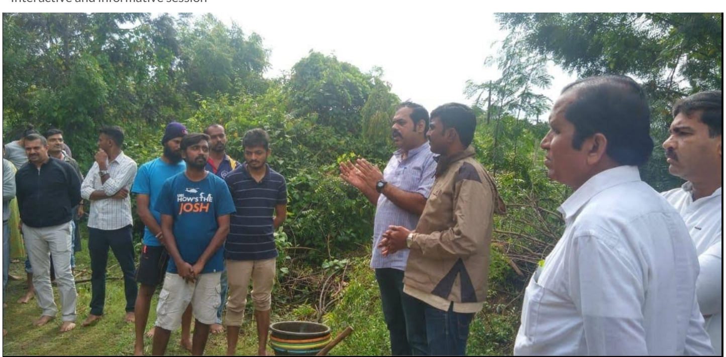
Detailed Report- I Love ,I Care ,I Serve -Native Cows, Mysuru

Tree Plantation Drive, Bategare, Sedam, Karnataka August 10th 2019, Saturday