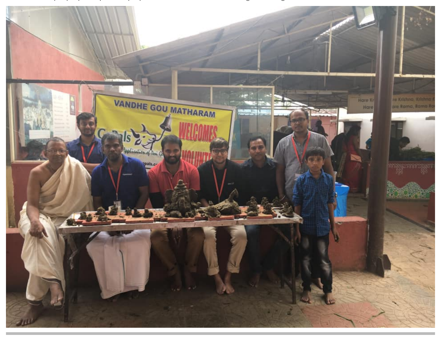
Viruksham ,Tree Plantation at Govindan goshala, Chennai September 1st 2019, Sunday

{f N} early 40 people participated in our Vriksha Janani tree plantation event in Chennai. Some glimpses of the event.